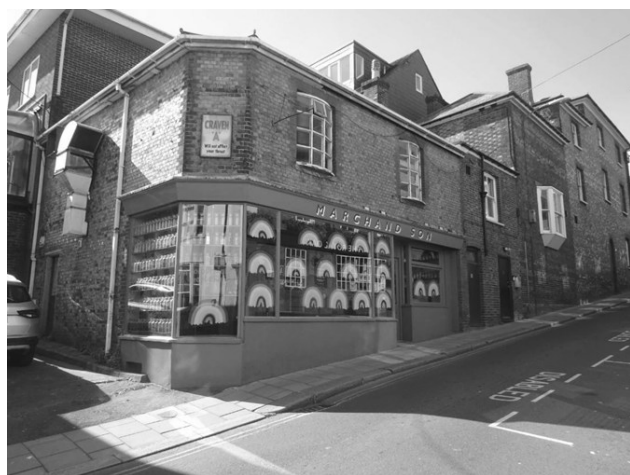
2020 PAINTSHOP WITH LOCKDOWN RAINBOWS