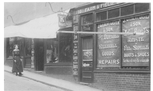
1910 GASTER & SONS