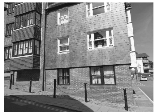
2025 CABURN COURT