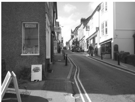
C2010 SHOWING PUNZI

2006—? Punzi home made jewellery, fossils and stones