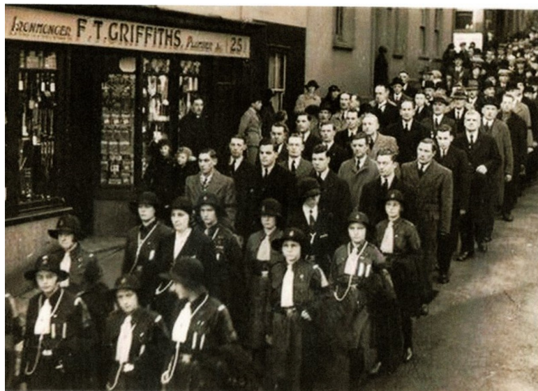
1936 GEORGE V'S FUNERAL PROCESSION OUTSIDE NUMBER 24-25