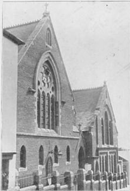
LEWES WESLEYAN CHURCH.