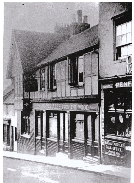
PUB WITH PENFOLD'S NEXT DOOR

1969-70 Gallery 23, picture dealers and arts and crafts Richard Whitmore